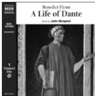
A Life of Dante (Flynn) 1CD – NA122312