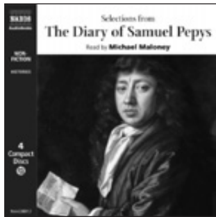
The Diary of Samuel Pepys (Pepys) 4CD – NA428812